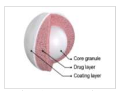
Figure 1 Multi-layer microgranule

Oral MR drug delivery system includes either single- or multiple-unit dosage forms, the latter consisting of pellets/beads/microgranules, microparticles and minitablets. Multiple-unit dosage forms have several advantages: 14,19